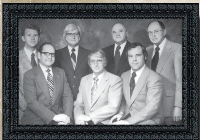
THE PALACE GUARD

PCAA Annual Meeting & Celebration TUES, JULY 19, 2016 @ 6PM