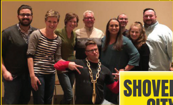
Members of Shovel City Improv gather for a photo after their October performance.