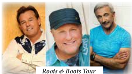
Roots & Boots Tour

Sammy Kershaw • Collin Raye • Aaron Tippin