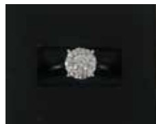
Diamond Cluster Ring