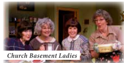
Church Basement Ladies