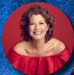
AMY GRANT NOV 5