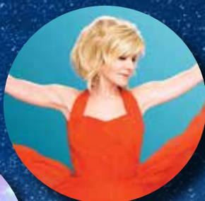
DEBBY BOONE DEC 12