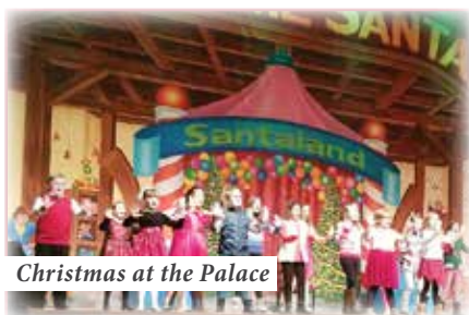
Christmas at the Palace