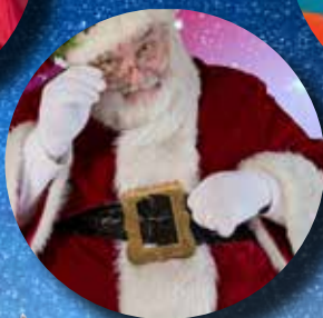
CHRISTMAS AT THE PALACE DEC 3-5