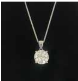
Diamond Cluster Pendant