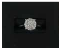
Diamond Cluster Ring